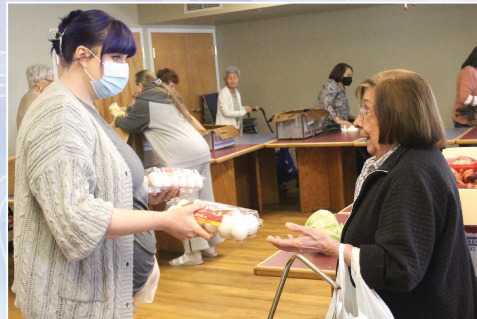
Throughout 2021, Brothers Redevelopment's Aging in Place Program connected adults age 60+ to resources like food assistance, health care, financial assistance and more.