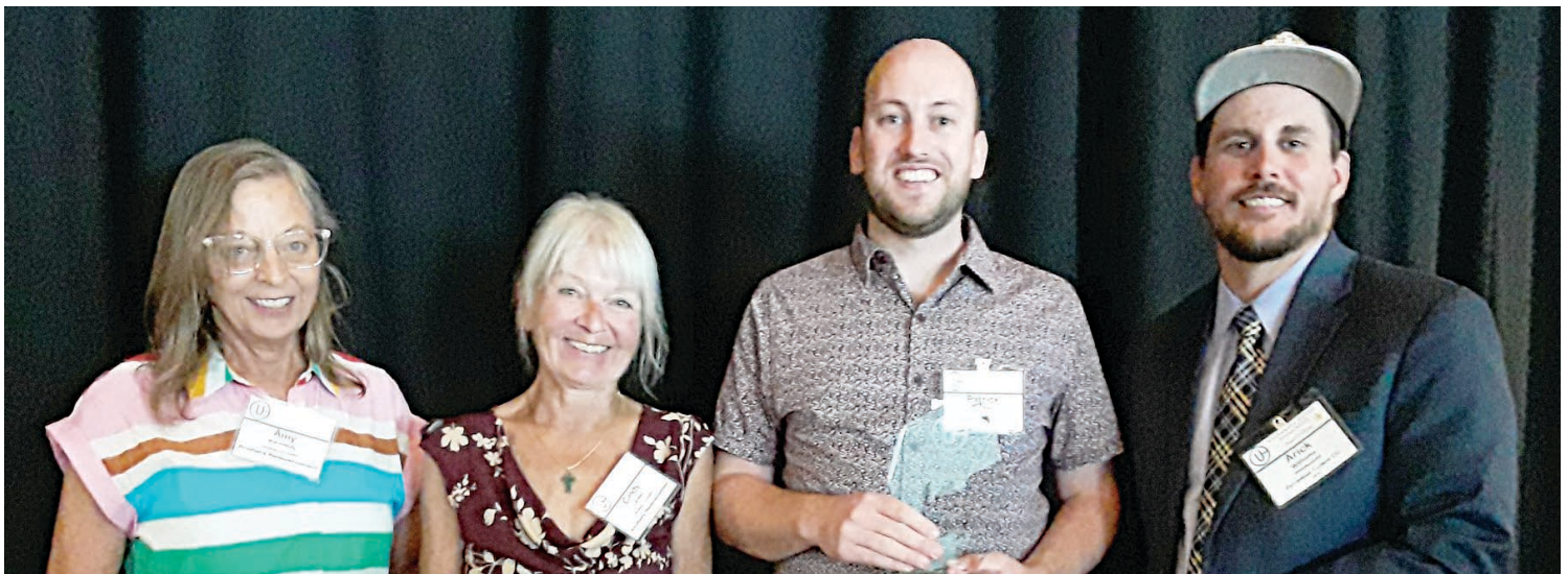
Colorado Housing Connects staff poses for a photo at the Consumers United Association's Right on the Money Award event where we were awarded funding for our housing counseling services. As a HUD approved housing counseling agency, Colorado Housing Connects provides diverse housing counseling services, including homeownership readiness, affordable housing assistance, financial education, and foreclosure prevention.

Navigating homeownership is a delicate balance between your home as a shelter and an asset for wealth building. For homeowners, decisions like major repairs, buying a car, settling debt, or funding a child's education may prompt consideration of tapping into equity. However, our post-purchase counseling provides impartial guidance on refinancing, home equity lines of credit, managing major expenses, and leveraging homeownership for wealth building.