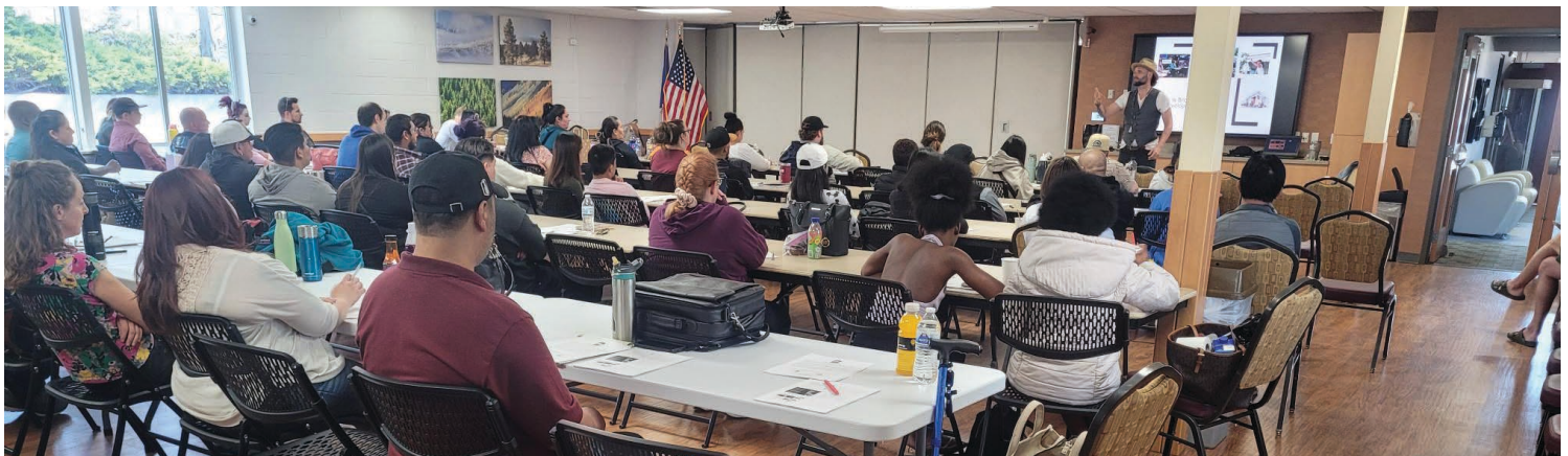
A Colorado Housing Connects housing counselor leads a homebuyer education course, providing attendees with essential knowledge about the homebuying process. Colorado Housing Connects offered 35 homebuyer education courses in 2023, empowering community members with the tools and information needed for successful homeownership.

Housing is considered affordable if the total cost, including rent or mortgage and utilities, is no more than a third of the household's